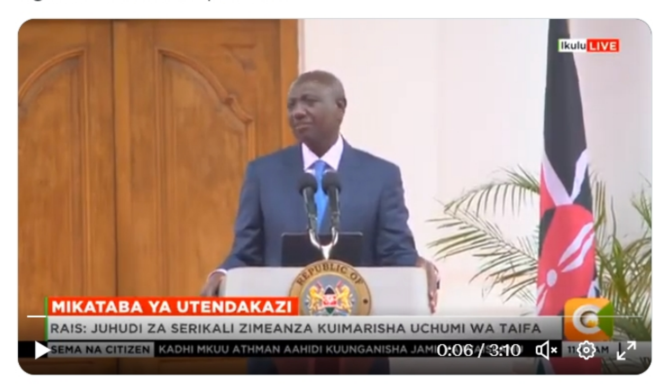
4:58 PM · Aug 1, 2023 · 519.3K Views

How do you run a department if you don't have knowledge? That is the highest level of incompetence.